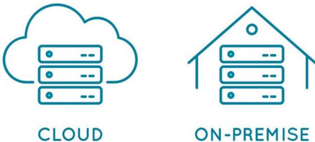
Figure 1: Multi-user leak management with CS Instruments Cloud or On-Premise installation of Leak Reporter software components.

The installation of the components can be done on the customer's server (on-premise). On the other hand, CS INSTRUMENTS offers the much more modern approach of a cloud solution, where the application runs on servers of CS INSTRUMENTS. See Fig. 1.