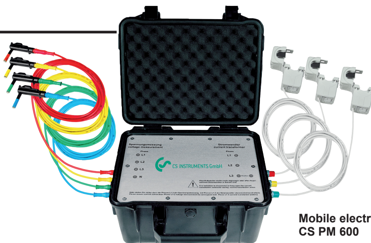
Mobile electricity/effective power meter CS PM 600