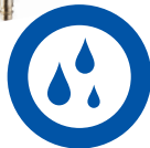
Pressure dew point