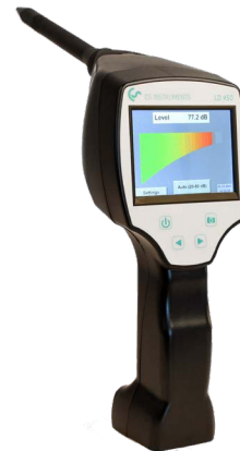
LD 450 with straightening tube and straightening tip for accurate detection.