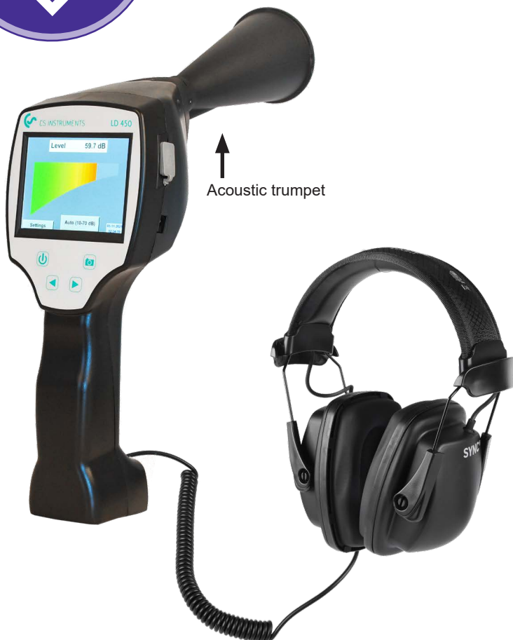
↑ Acoustic trumpet