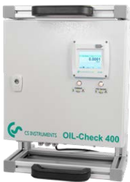
Handle and stand