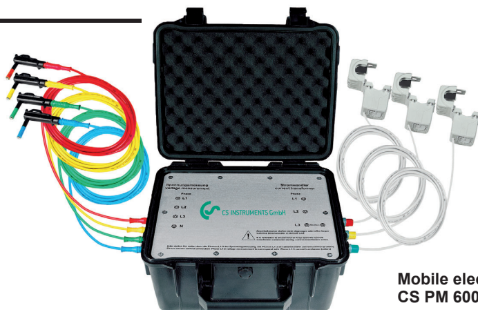
Mobile electricity/effective power meter CS PM 600