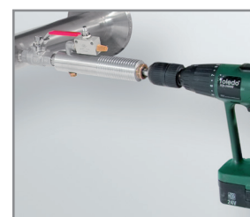
Drill under pressure with the CS drilling jig

By means of the drilling jig, it is possible to drill under pressure through the 1/2" ball valve into the existing pipe. The drilling chips are collected in a filter. Then install the probe as described under 1).