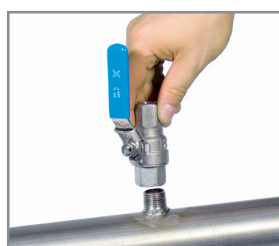
A Welded Nipple

B Mount spot drilling collar incl. ball valve (see accessories).