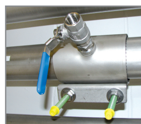
B Spot drilling collars