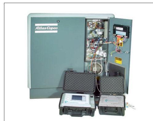
Example: Measurement on the compressor

All measured data are transferred digitally (Modbus) to DS 500 mobile/ DS 400 mobile and can be recorded there.